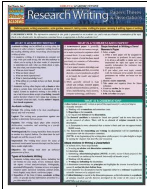
Filesize: 9.3 MB